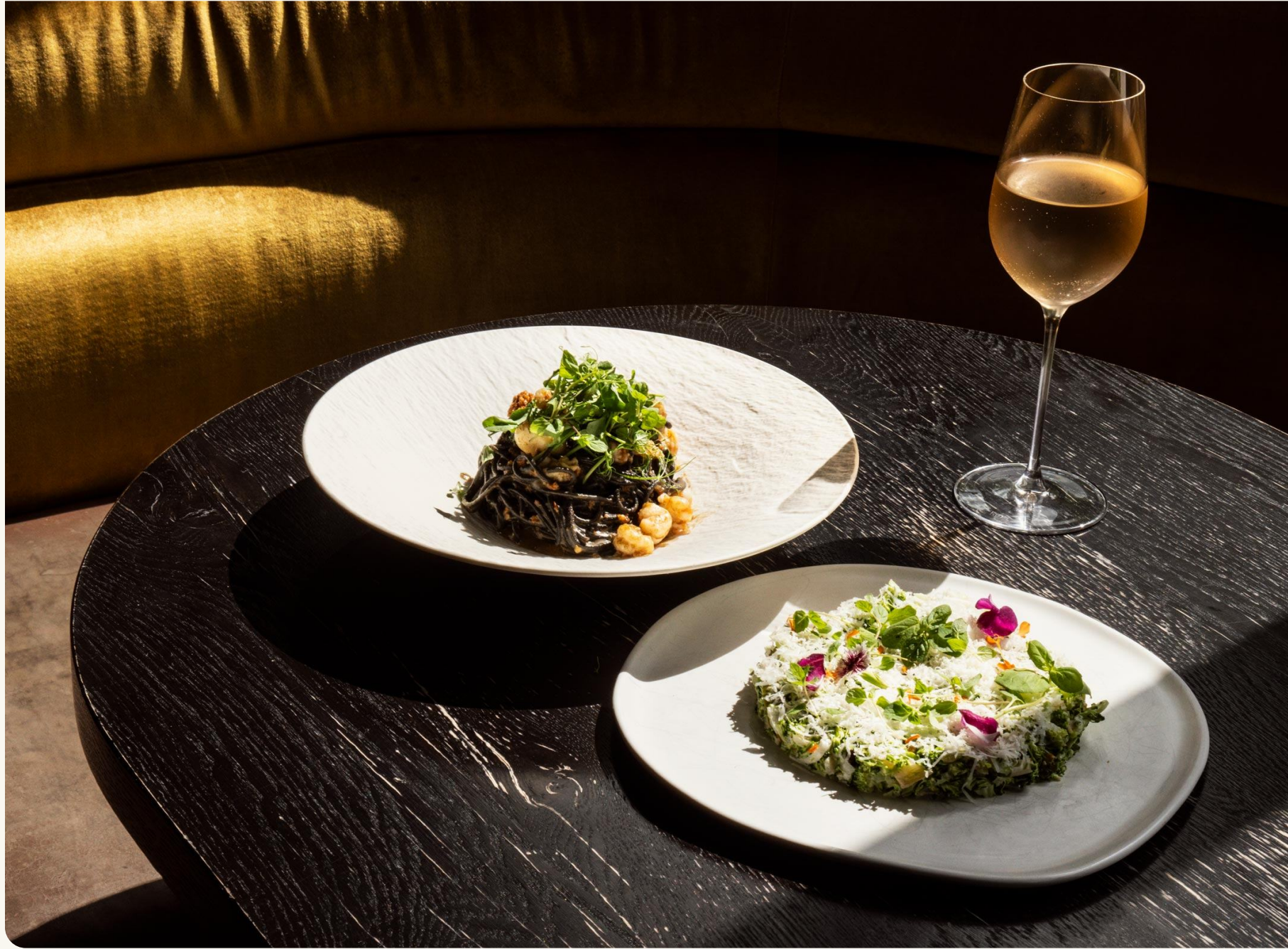
Eating out in Midtown offers a feast for every appetite, from meticulous fine dining restaurants to beloved diners, coffee shops, and wine bars.