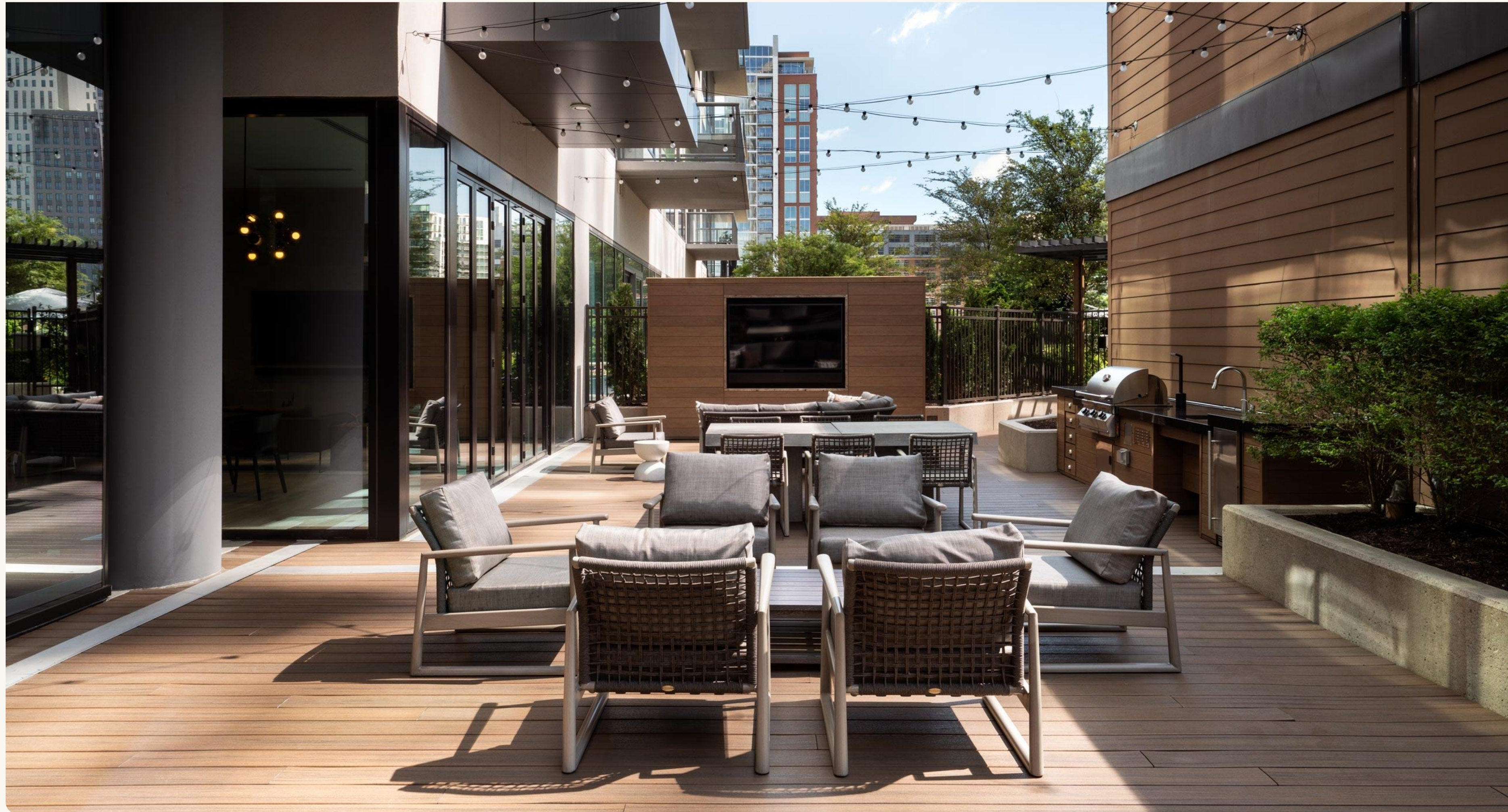
A sprawling outdoor living room with grills, seating, and televisions offers space to unwind, along with a private pathway to the Epicurean Hotel's rooftop pool.